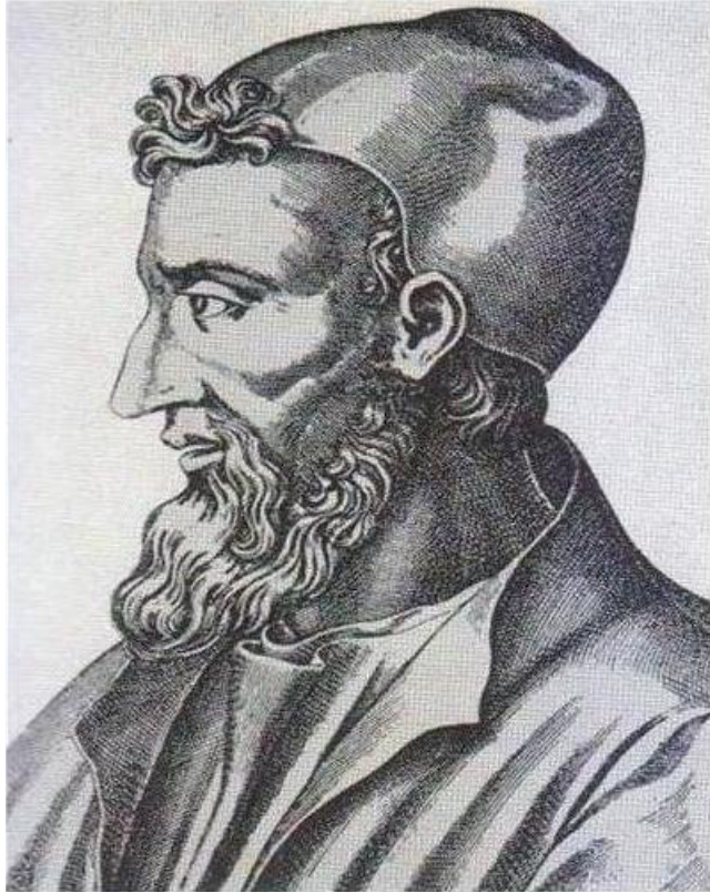
Figure 4. (131-201) who gave an incorrect description of the circulation of the blood.