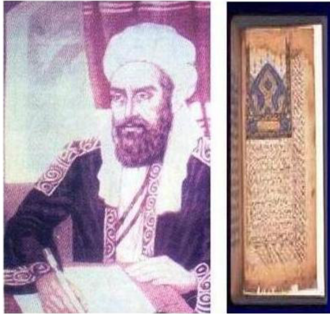
Figure 1. Ibn al- Nafis described the movement of blood through the pulmonary transit, explicitly stating that the blood in the right ventricle of the heart must reach the left ventricle by way of the lungs and not through a passage connecting the ventricles, as Galen had mentioned.

anatomist from Asia minor who, while working in Alexandria, pioneered the study of anatomy, and described the brain as a center of the nervous system and seat of intelligence 3 . He dissected the heart and found several cavities in it, also noted that by observing the pulse it was possible to evaluate the seriousness of diseases. (Figure 1)