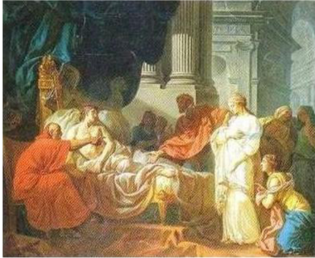
Figure 2. Erasistratus diagnosing the sickness of Antiochus as the result of his passion to Stratonice (his stepmother).

sources until the third century not one could give a clear and consequent account concerning the blood circulation.