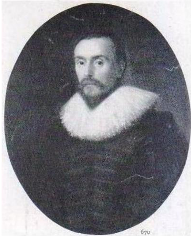
Figure 6. William Harvey. Of paramount importance was Harvey's discovery of the circulation of the blood which was published in 1628.

Heart and Blood in Animals") in Germany in 1628. In this important work, considered the greatest medical treatise of all time, William Harvey "detailed the flow of blood from the right side of heart through the lungs, into the left side of the heart, then through the arteries into the veins, and finally back into the right side of the heart." This argument required Harvey to take a bold deductive leap from the arteries into the veins, sine minute blood vessels (the capillaries), which carry blood from the arteries to the veins, could not actually be seen until the microscope had been perfected.