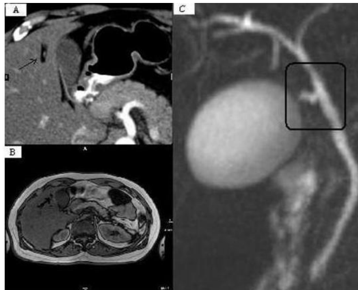
Figure 2. Preoperative radiological imaging of upper abdomen of patient; black arrows show round ligamentum of liver where the gallbladder is located medial to it (A: Computed Tomography, B: Abdominal Magnetic Resonance Imaging) and MRCP (C) shows normal anatomic joining of cystic duct to hepatic duct.

operation and it took about 40 minutes to finish the operation. The patient recovered without any complica-