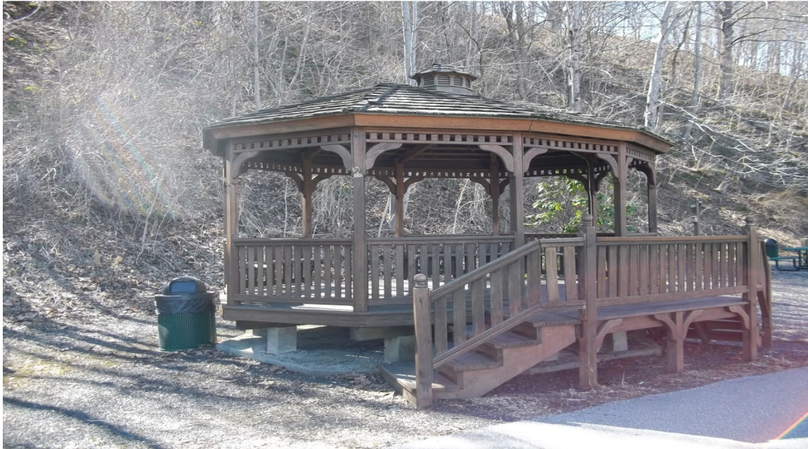
Figure 2. Gazebo at the trail