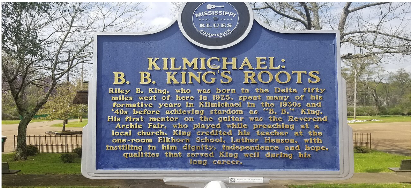
Figure 3. Marker of B.B. King Birthplace