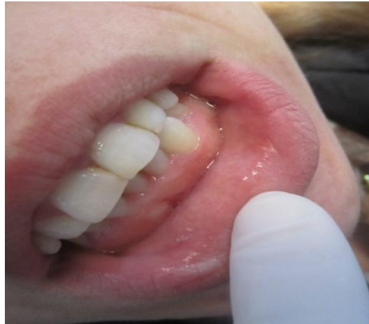
Figure 1c. 4 weeks after the treatment with 980 diode laser wound was completely healed without scarring