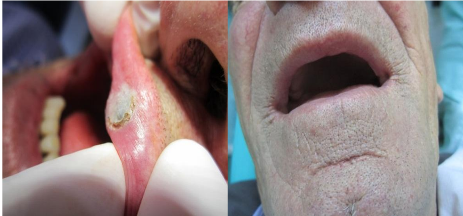
Figure 2b. Immediately after the treatment c. 4 weeks after the treatment

groups under control. If the calculated probability is lower than 0.05 (in this case 0.001) the null-hypothesis is rejected and variables are significantly different from each other. This suggests that there is statistically a difference between the groups which were applied the laser and the control group; the scalpel method.