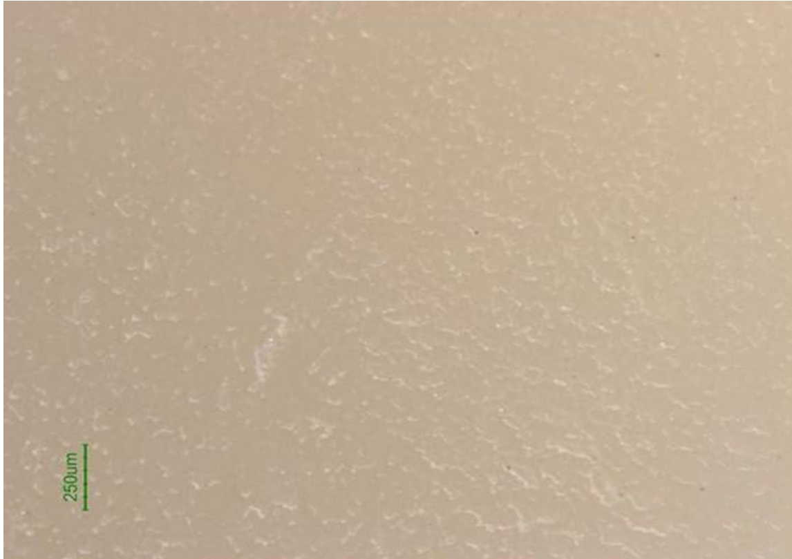
Figure 4. Scanning electron micrograph of the surface of group 3 where surface sealant (G-Coat Plus) was applied ( \times 1000 magnification).