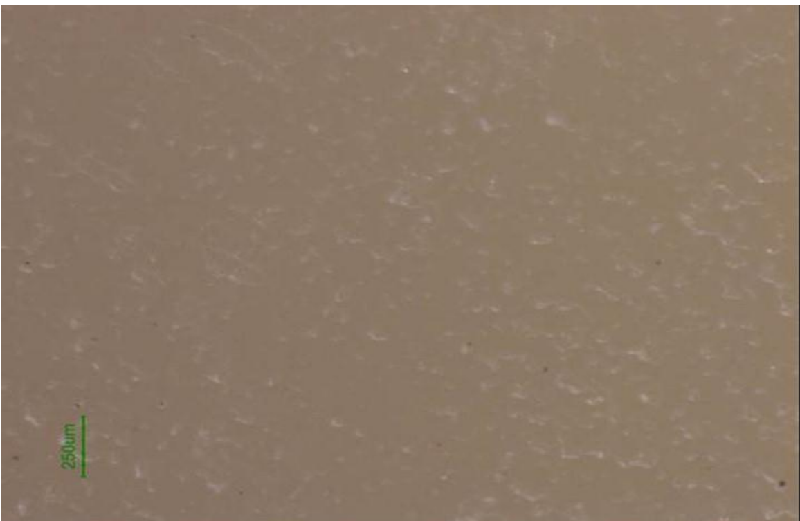
Figure 3. Scanning electron micrograph of the surface of group 2 where surface sealant (Biscover LV) was applied (×1000 magnification).