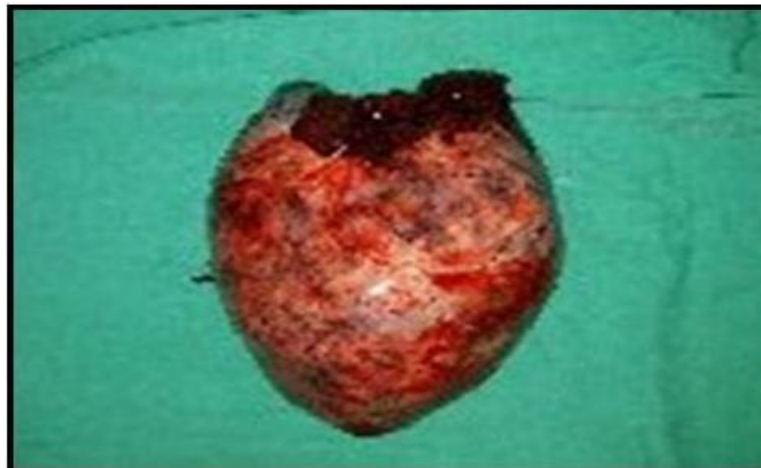
Figure 4. Macroscopic appearance of the resected ovarian fibroma (our case).