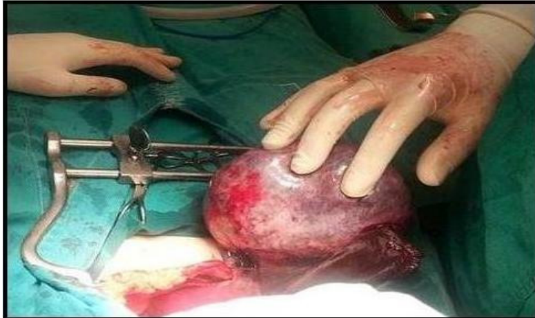
Figure 3. Intraoperative picture showing the twisted ovarian fibroma (our case).