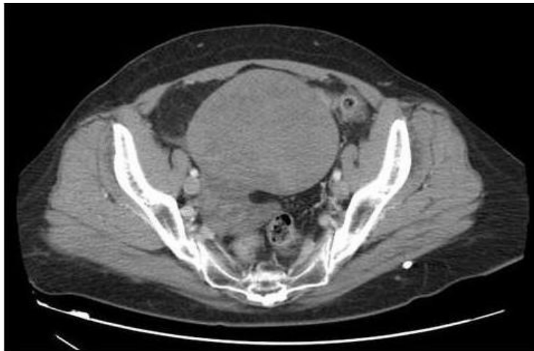
Figure 2. Computed tomography showing the twisted ovarian fibroma (our case).

mentioned a known uterine fibroma which was firstly diagnosed a decade ago. Her hereditary history was without any pathology. Physical examination revealed a painful pelvic mass in the right adnexa. Based to the mentioned uterine fibroma and the clinical suspicion of adnexal mass, the patient underwent to imaging control. Abdominal ultrasonography was not that diagnostical. Vaginal ultrasonography showed a solid, distinct, homogeneous mass in the right ovary without the presence of an invasive mass from the uterus (Figure 1). Pelvic computed tomography (Figure 2) confirmed the ultrasound findings without the exclusion of apedunculated subserosal uterine fibroid. Emergency lab tests: Ht 29.3%, Hb 9.9gr/dl, PLT: 236 \times 10^3 /ml, WBC 13.94 \times 10^3 /ml, NEUT 81%, CRP 23.06 mg/dl. The coagulating mechanism, the biochemical blood test as well as the urine test was clear.