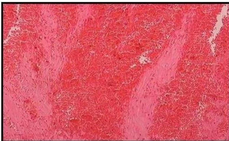
Figure 5. Histopathology of ovarian fibroma (our case). The presence of spindle cell isoblastic, which are arranged in a bundle-like and storiform growth pattern, with mild hyalinization of the stroma.